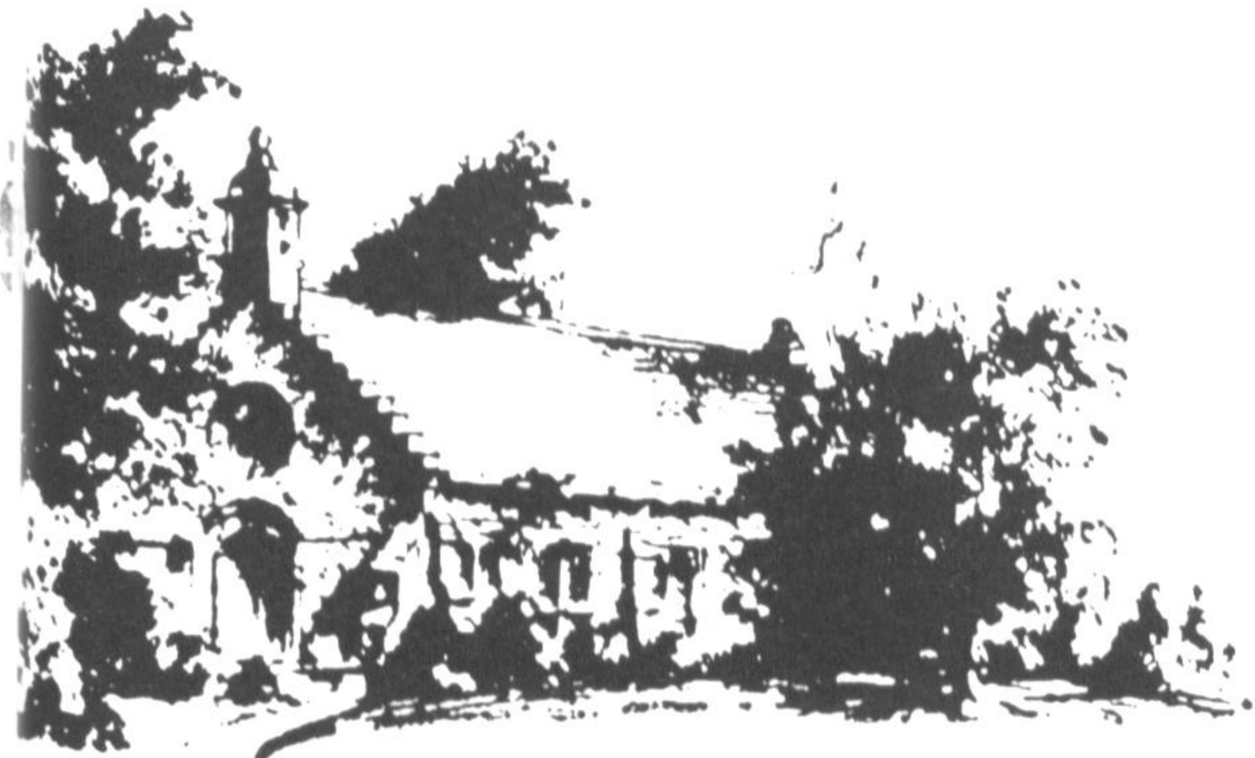
Wee Kirk o'the Heather